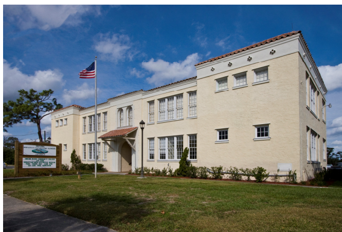
Sebastian Grammar School built c. 1927 - home of the Sebastian Area Historical Museum

Visit the Museum Gift Shop for books, postcards, gifts, and more!