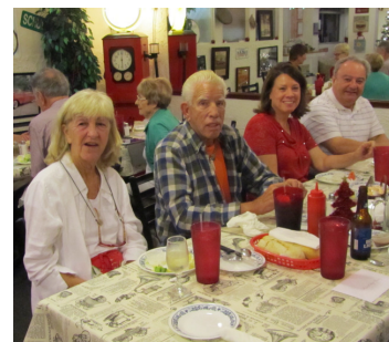
SAHSI Board Members, Friends and Families